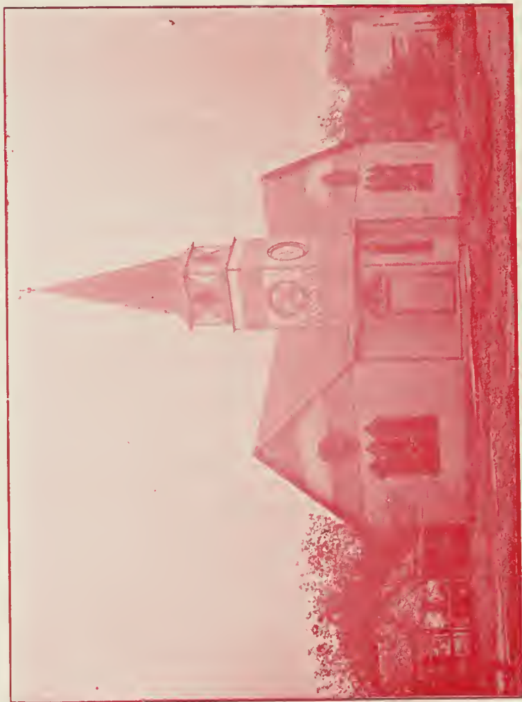
Methodist Church, Seandia, Kansas.